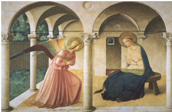
The Annunciation by Fra Angelico